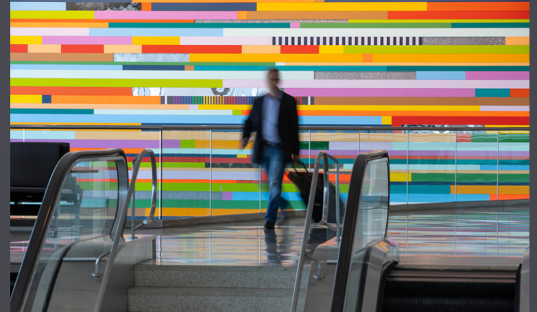
Leah Rosenberg, Everywhere, a Color , SFO International Terminal