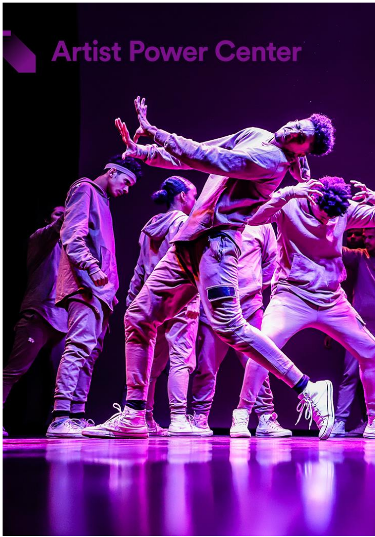
21AIE05 YBCA Artist-Power-Center

The San Francisco Arts Commission is committed to creating a city where all artists and cultural workers have the freedom, resources and platform to share their stories, art and culture and where race does not predetermine one's success in life. We also acknowledge that we occupy traditional and unceded Ohlone land. Fueled by these beliefs, we commit to addressing the systemic inequities within our agency, the City and County of San Francisco and the broader arts and culture sector. This work requires that we focus on race as we confront inequities of the past, reveal inequities of the present and develop effective strategies to move all of us towards an equitable future.