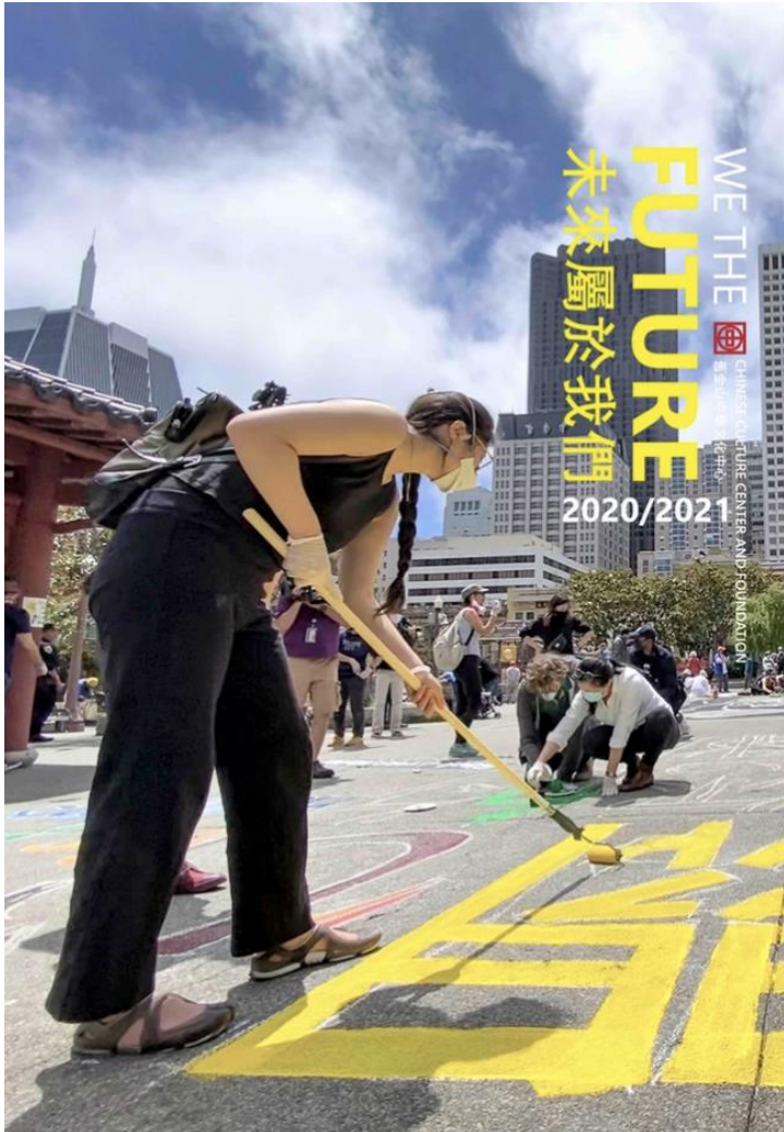
20CEI07 Chinese Culture Foundation, We the Future Annual Book