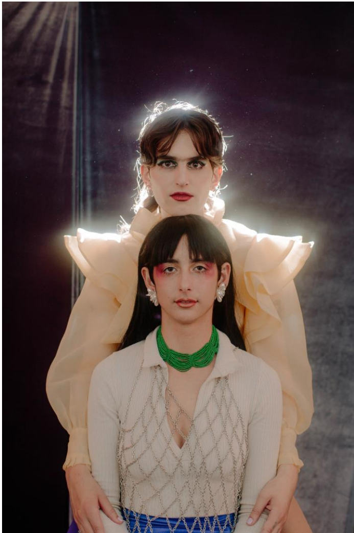
IAC 2020 Silk Worm

Supports artistic commissions that stimulate the creation and presentation of creative works of art presented throughout the city's neighborhoods.