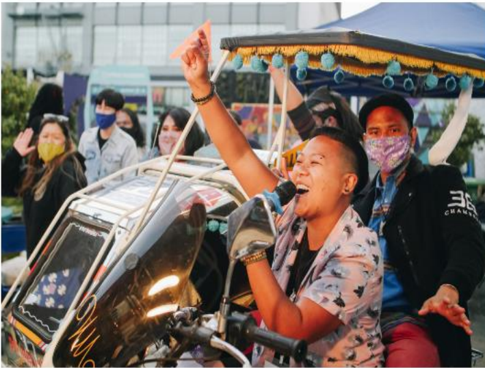
Asian Pacific Islander Cultural Center USAAF at Kapway Gardens