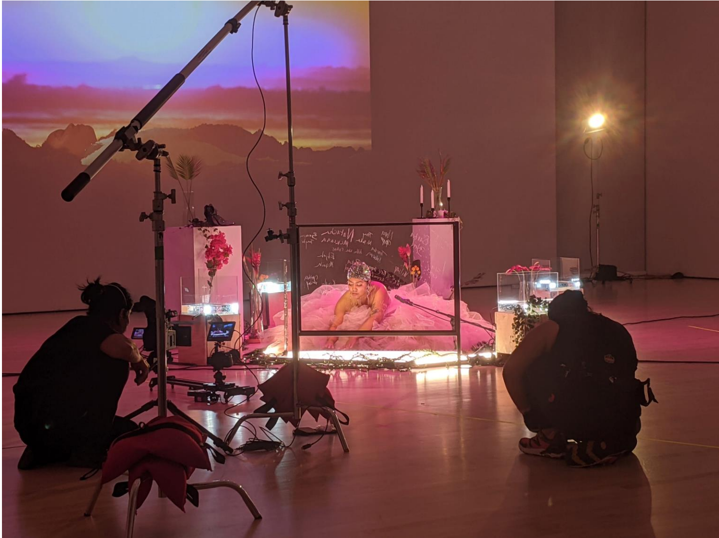
2020 IAC Sarah Cargill performing Lucid Dreams