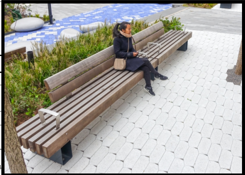
Example photo of park bench